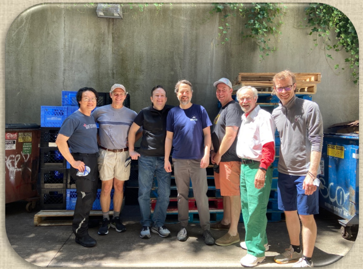
Brothers volunteering at the University Food Bank in August!