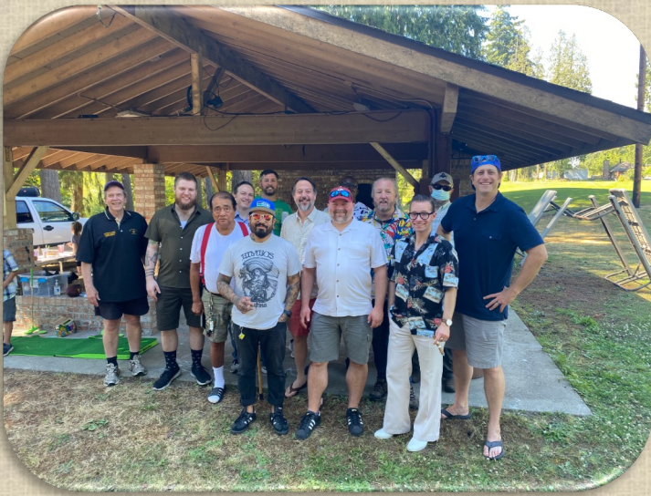
Brothers hanging out at the lodge picnic in July!